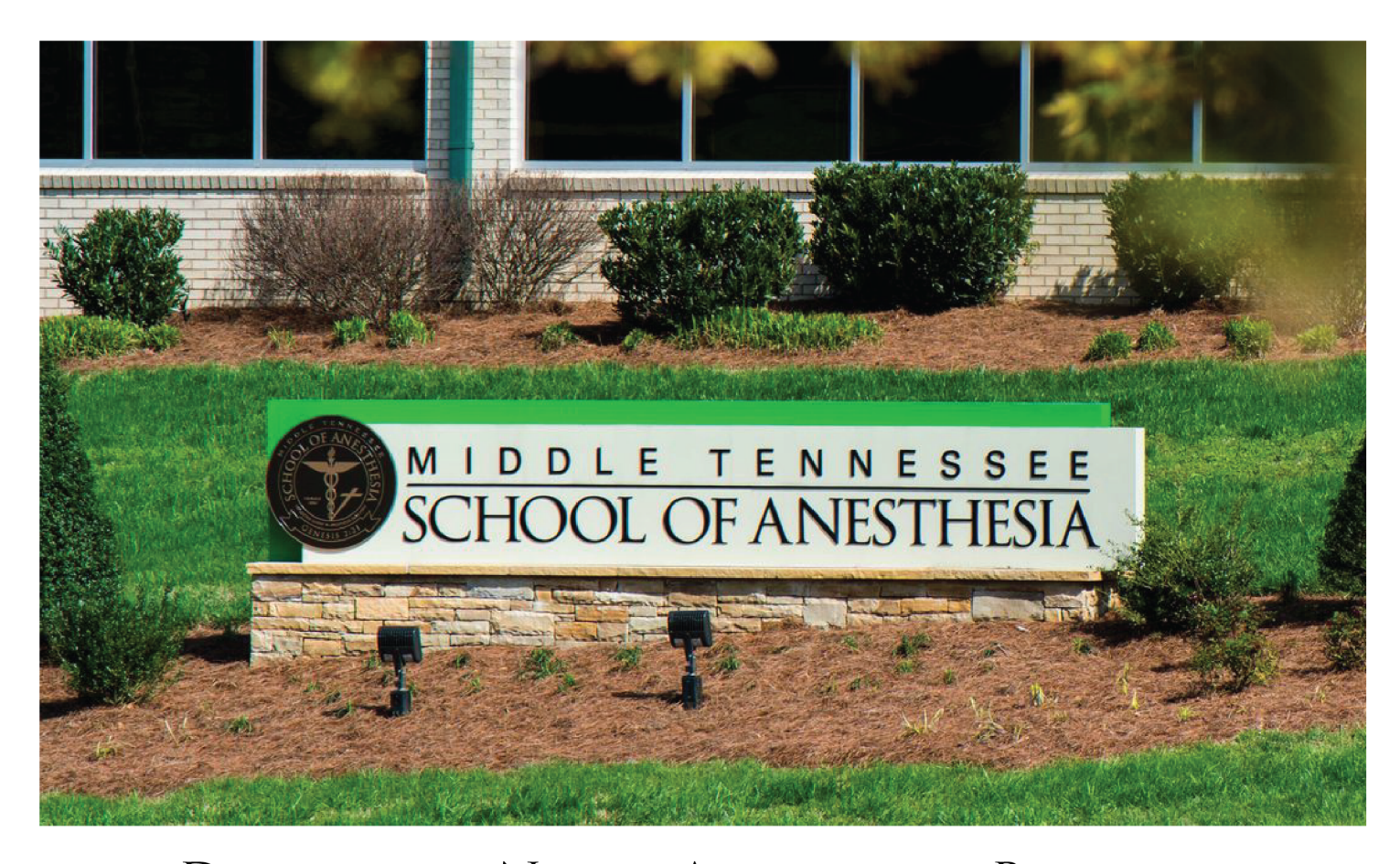
DOCTOR OF NURSE ANESTHESIA PRACTICE (DNAP) COMPLETION PROGRAM